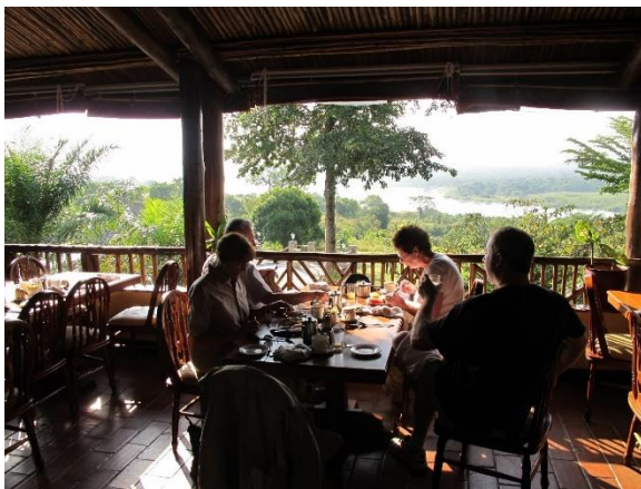
...of course, followed by relaxing evening dinners at the lodge overlooking the Nile.

Our driver/guide was very knowledgeable about the ways of the wildlife, and we had a day or two on ‘game drives’ starting early. The Murchison Falls Game Reserve was teeming with giraffe, buffalo and many other beasts with excellent close-up views from our vehicle.