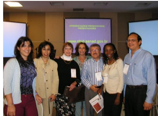
1st Pan American Conference on Alcohol Policies, Brazil, 2005