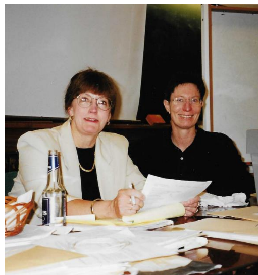
IRGGA pre-KBS meeting, Oslo 2000