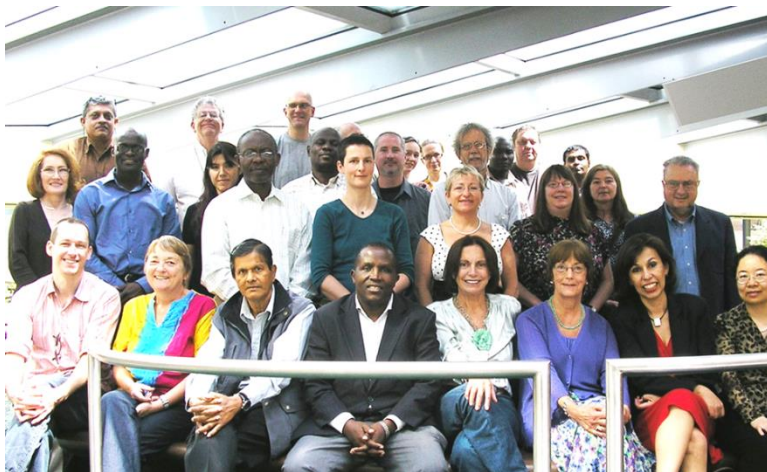
KBS 2011 Melbourne, Australia