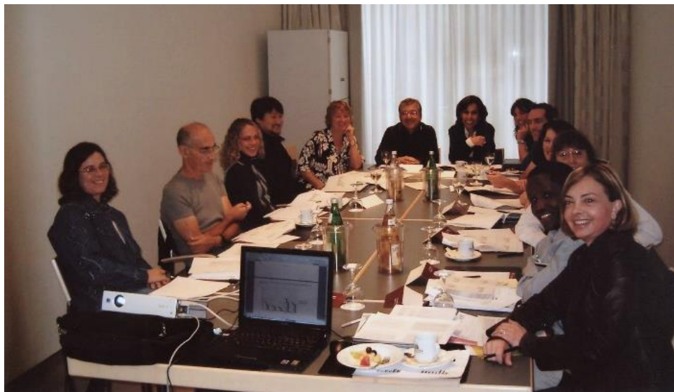
GENACIS people hard at work, Berlin, 2003