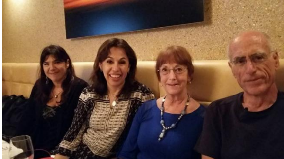
KBS Stockholm, Sweden, 2016