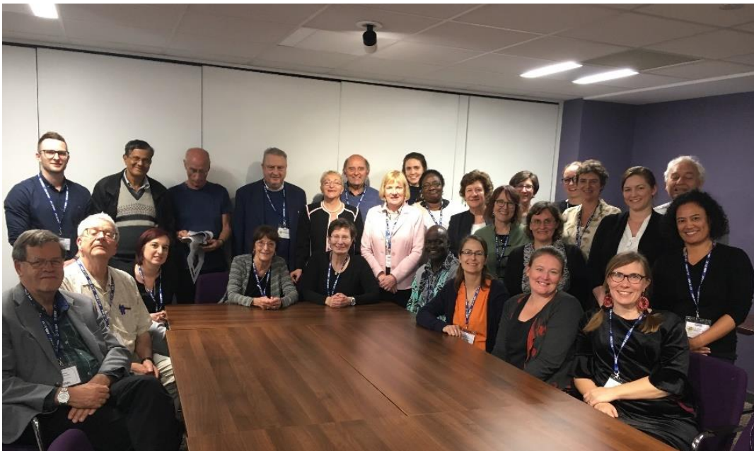
Pre_KBS GENACIS. GENAHTO, IGSAHO Workshop in Sheffield, UK; 2017