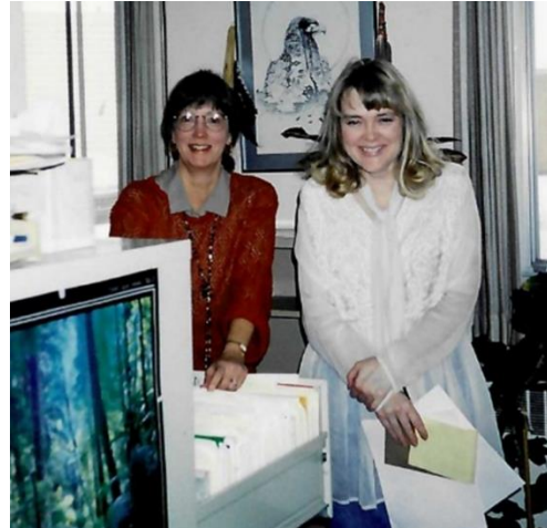
University of North Dakota, Grand Forks, ND, 1994