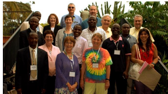
First KBS conference in Africa – Kampala, Uganda, 2010

Centre for Addiction and Mental Health, and Dalla Lana School of Public Health, University of Toronto, Toronto, Canada.