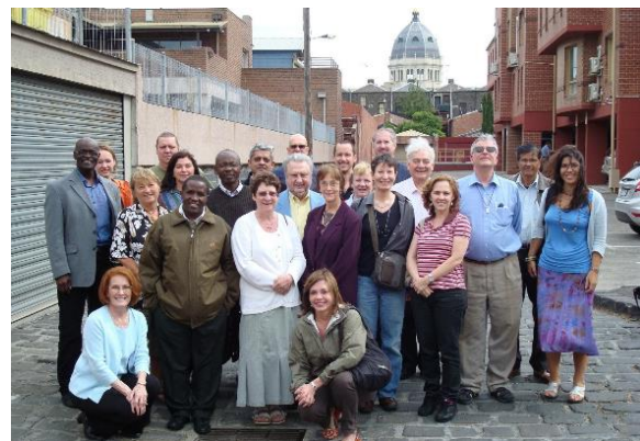
GENACIS pre-KBS meeting, Melbourne, Australia 2011