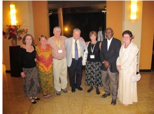
Kampala Conference Center before the safari, Kampala 2010