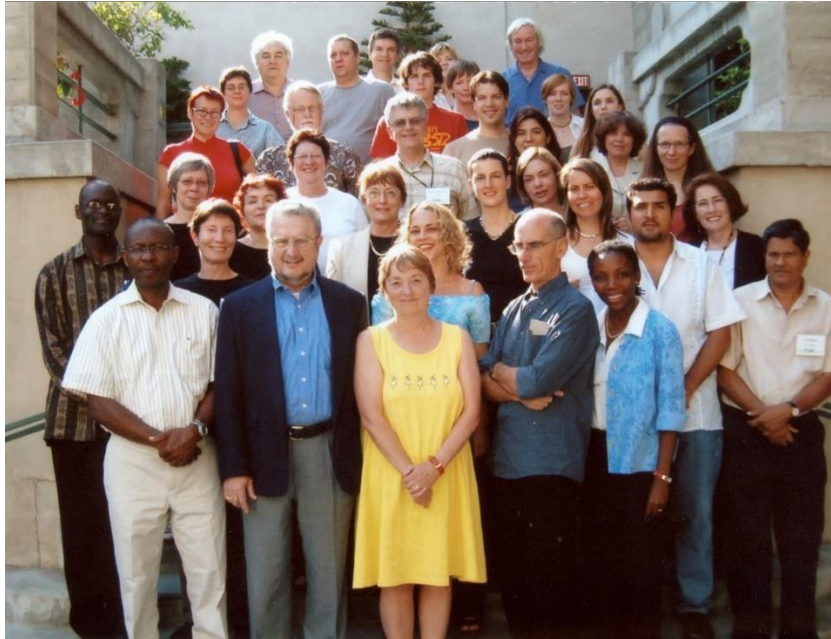
Some of the very large GENACIS family! Pre-KBS meeting, Riverside, California, USA, 2005