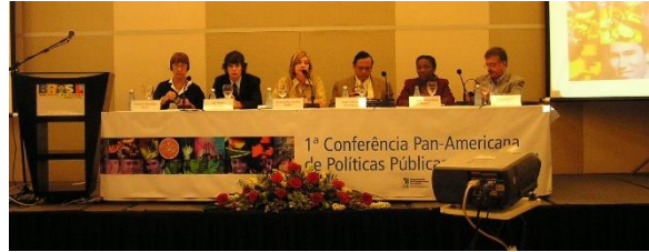
1st. PanAmerican Conference on Alcohol Policies, Brasil, 2005, (Photo source: Julio Bejarano)